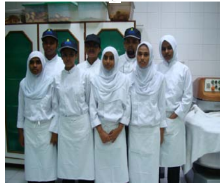
Pastry & Bakery Chef